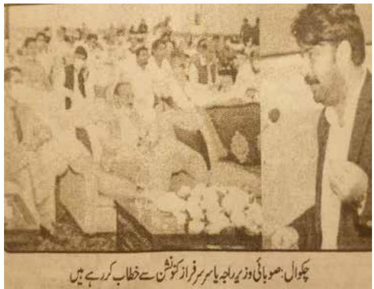
چکوال: صوبائی وزیر راجہ یاسر سرفراز کنونشن سے خطاب کر رہے ہیں