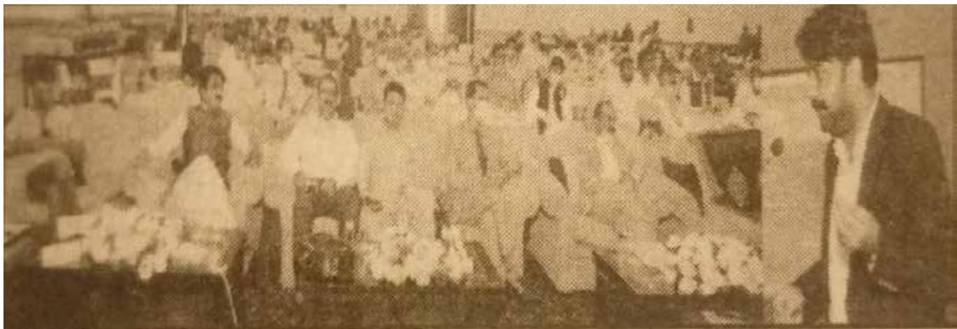
چکوال: صوبائی وزیر ہائر ایجوکیشن راجہ یاسر فرزانہ تنظیم راسی کے زیر اہتمام ماحولیاتی خطرات اور بچوں کا مستقبل سیمینار میں خطاب کر رہے ہیں۔

گلوبل وارمنگ کے خطرات کے پیش نظر لوگوں کو طرز زندگی میں تبدیلیاں لانے کی ضرورت خصوصی طور پر بچوں اور نوجوانوں کے مستقبل کے لاحق خطرات کا جائزہ لینا ضروری، یاسر فرزانہ پتھال (اسوات راجہ) صوبائی وزیر پانچگوشن راجہ یاسر فرزانہ نے کہا ہے کہ موسمی تبدیلیوں اور گلوبل وارمنگ کے خطرات کے پیش نظر لوگوں کو اپنے رہن کن اور طرز زندگی میں تبدیلیاں لانے کی ضرورت ہے، ماحولیات تبدیلیوں کے اثرات انسانی زندگی اور خصوصی طور پر بچوں اور نوجوانوں کے مستقبل کے لاحق خطرات کا جائزہ لینا ضروری ہے اور اس ضمن میں ایسی سہولیات مہیا کی جانی چاہیں جس سے پالیسی سازی مہلک ہو سکے اور سماجی تنظیم راجہ یاسر فرزانہ کے کاغذوں کے بنیادی مقاصد کا ذکر کرتے ہوئے بتایا کہ ضرورت اس امر کی ہے کہ ماحولیات تبدیلیوں کے اثرات کی پر اثرات اور خاص طور پر بچوں اور نوجوانوں کے مستقبل کے لاحق خطرات کا جائزہ لیا جائے اور ایسی سہولیات مہیا کی جاسکیں جس سے پالیسی سازی مہلک ہو سکے، عوام الناس میں آگہی فروغ پانے اور نوجوانوں کی اجتماعی ذمہ داریوں کا تقاضا ہے کہ اس کاغذوں سے خطاب کرتے ہوئے گلوبل وارمنگ کے خطرات اور ماحولیات مہیا کر کے